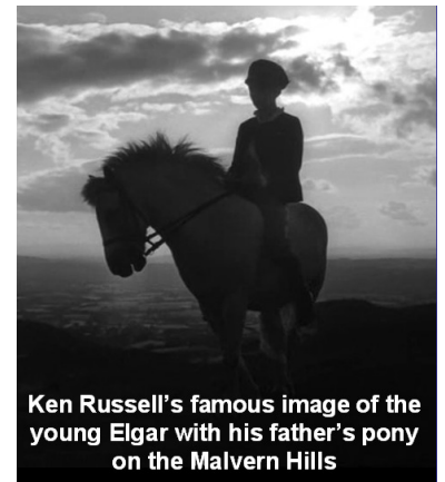
Ken Russell's famous image of the young Elgar with his father's pony on the Malvern Hills

He was born at Broadheath near Worcester in 1857. The humble house of his infancy is now the Elgar Birthplace Museum and Visitor Centre, with a modern extension behind. His father owned a music shop in Worcester, and from 1863 the Elgars lived over the shop. At about the age of ten, young Edward composed music for a family play, and he later drew on these ideas for The Wand of Youth suites (1907/8) and The Starlight Express (1915). He attended a Catholic school. Violin lessons were his only formal training in music. Otherwise his ‘teachers’ were the music books and instruments in his father’s shop.