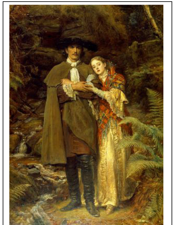
Bride of Lammermoor by Millais

derives from the wrong author (Burns) and the wrong period! It was written when Berlioz was in his late 20s and living in Italy.