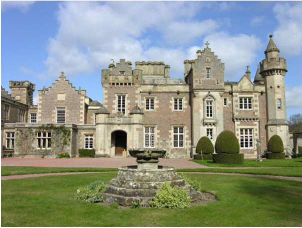
Scott made his home at Abbotsford, a house that he designed, located on the banks of the River Tweed in the Scottish Borders