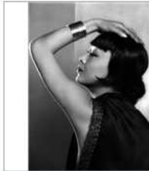
Anna May Wong