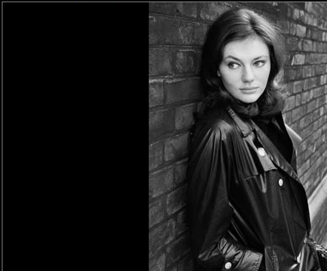
Jacqueline Bisset, London, 1964