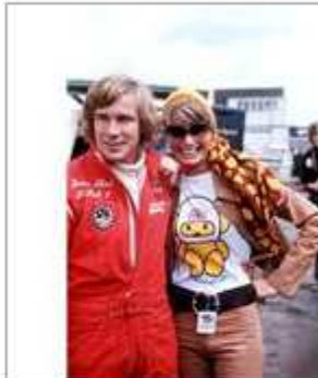
1974 BRITISH GP