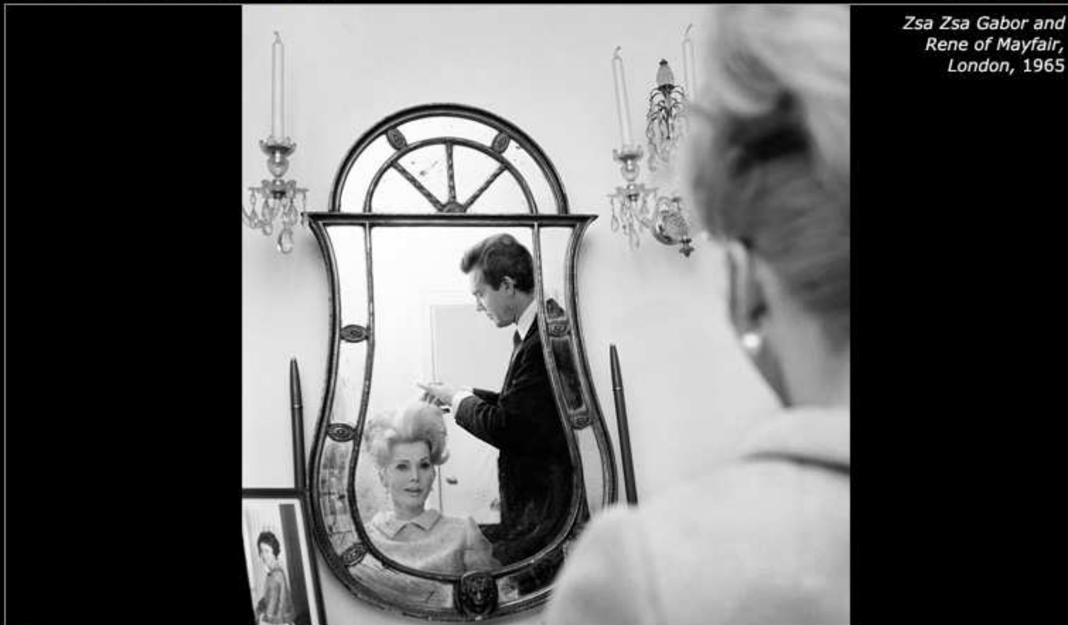
Zsa Zsa Gabor and Rene of Mayfair, London, 1965