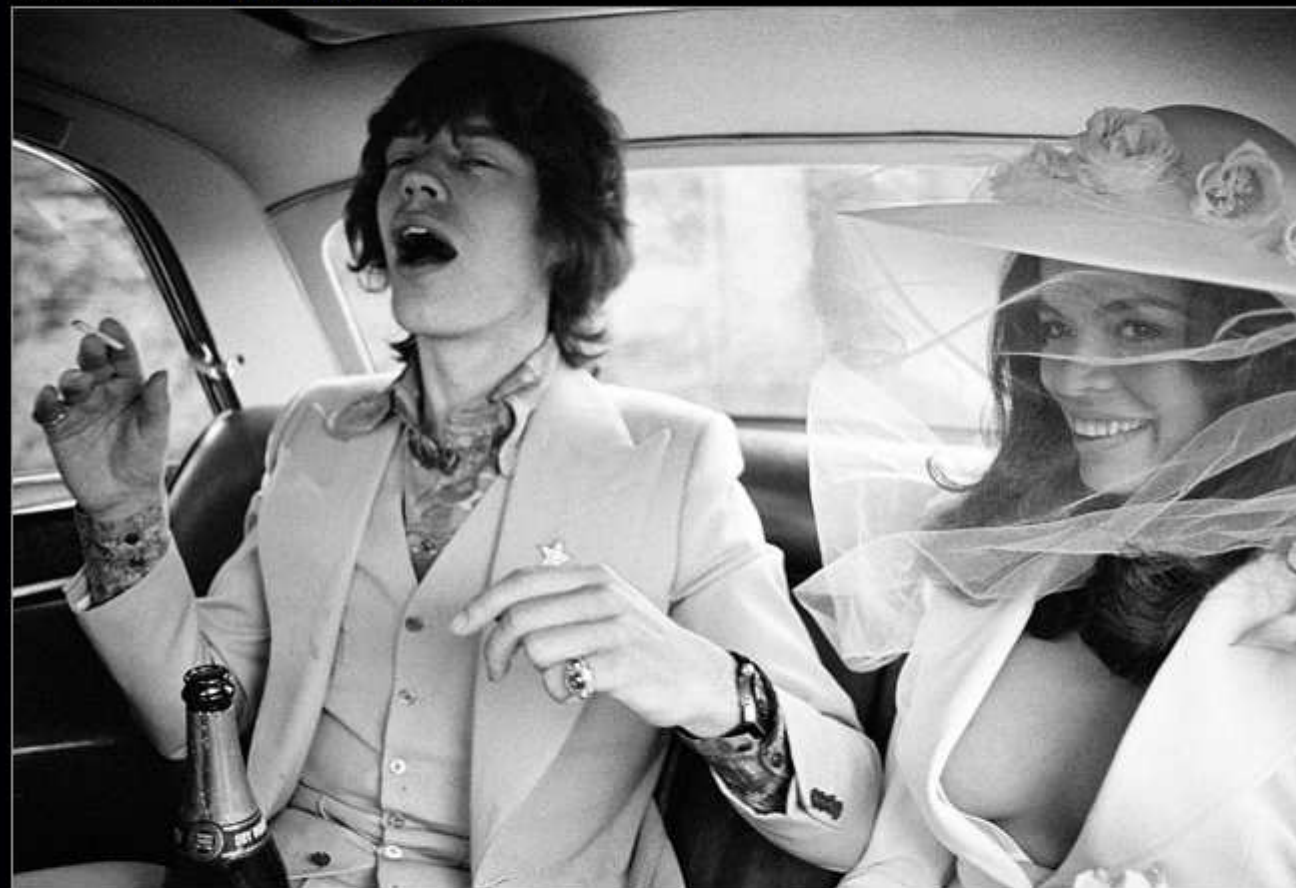
Mick and Bianca Jagger after their wedding, St Tropez, 1971