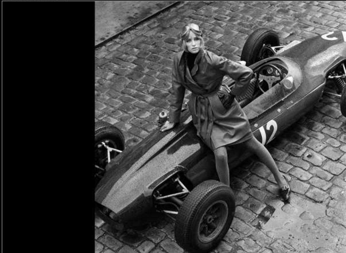
Jill Kennington with Lotus Formula One Racing Car, London, 1964