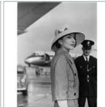
Callas At Heathrow