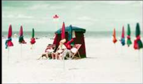
BLURRING THE BOUNDARIES