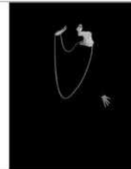
All In Black