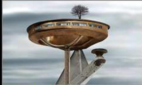
ALL MOD CONS