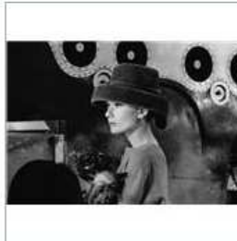
Audrey's Funny Face