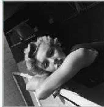
Far Away Look