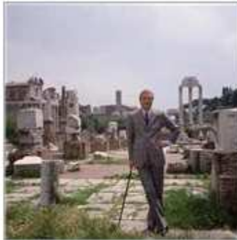
A Roman Prince