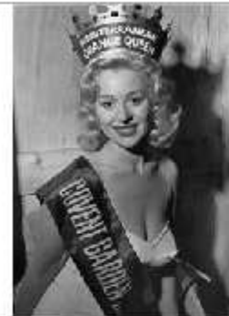
A Minor Royal