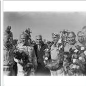
Alfa Romeo Team