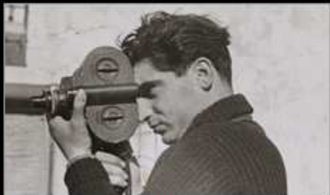
WAR CROSS'D LOVERS