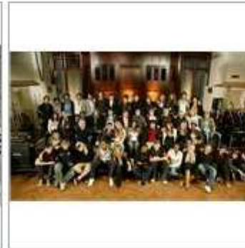
Band Aid 20 - Recording Session