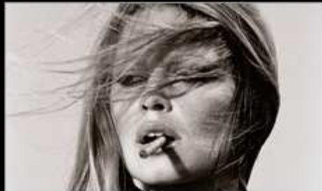
O'NEILL'S SIXTIES ICONS