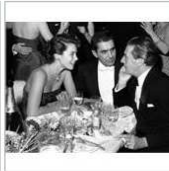
Cafe De Paris