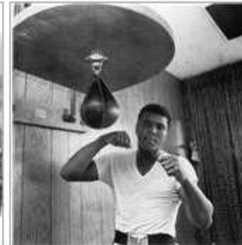
All In Training