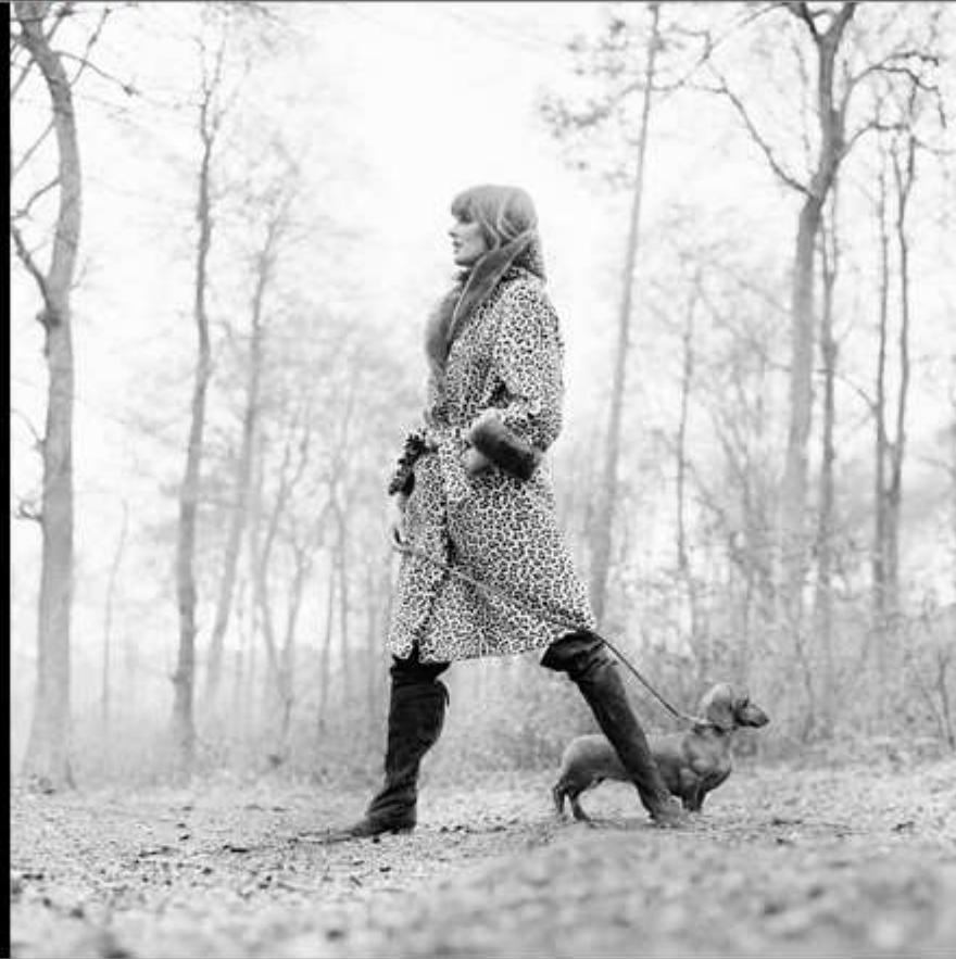
Grace Coddington with Dachshund, Buckinghamshire, 1964