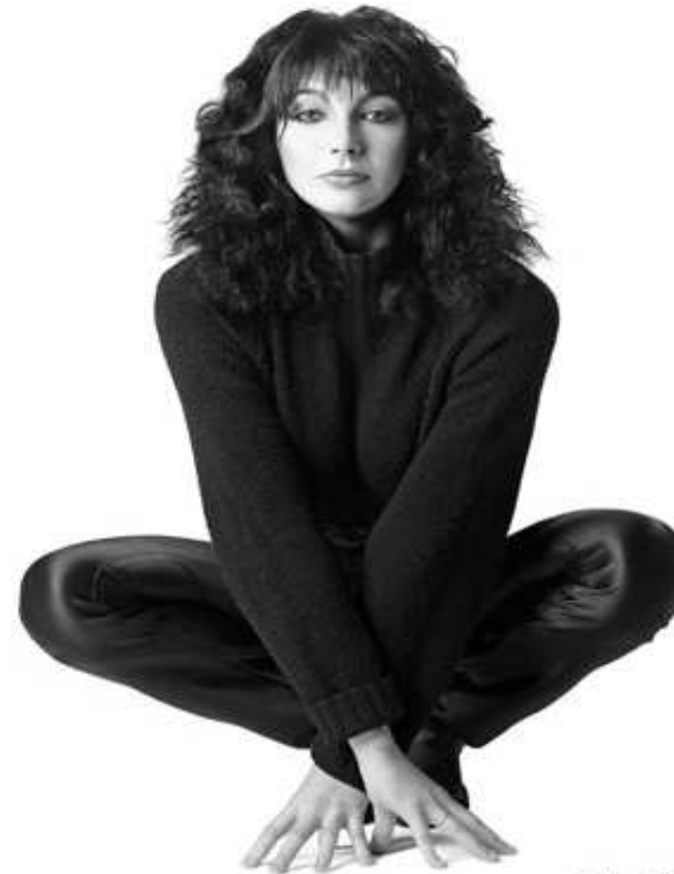
Kate Bush, 1980

Patrick Lichfield at Chris Beetles Gallery until June 4, 8 & 10 Ryder St, St James's, London SW1Y 6QB. All images copyright Lichfield/Getty Images