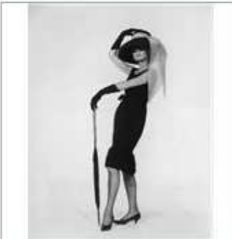
Audrey In Givenchy