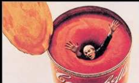
ESQUIRE'S COVER CHARGE