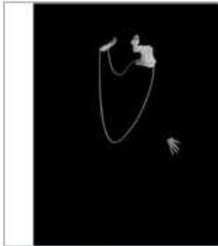
All in Black