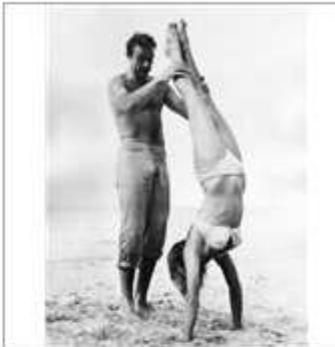
007 Catches Ursula