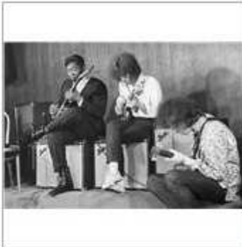
1967, New York City, Eric Clapton, B.B. King, Elvin Bishop