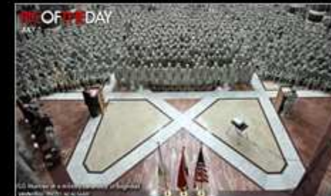
PIC OF THE DAY